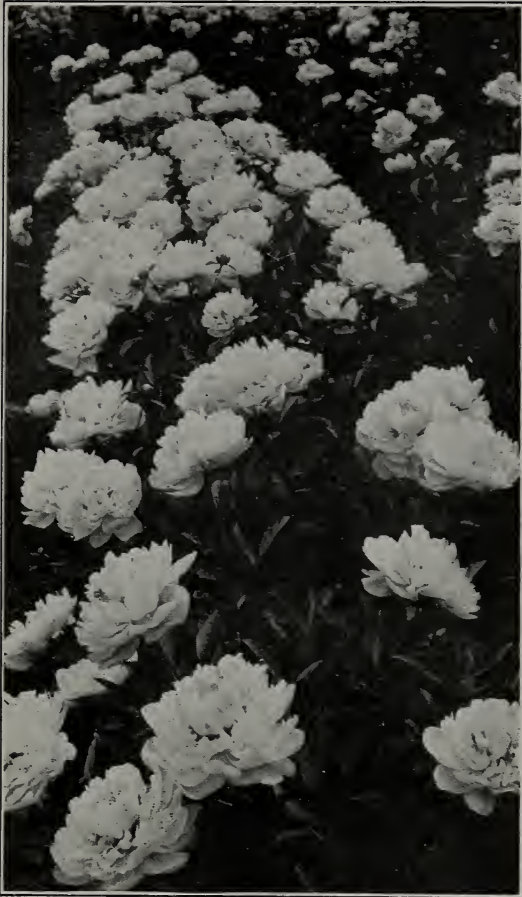
Germaine Bigot. Very profuse bloomer. One of the best newer varieties. Originator's description does not do it justice.